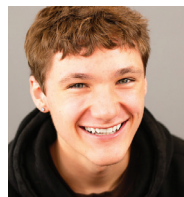
Beckett Fleet AMD A New York